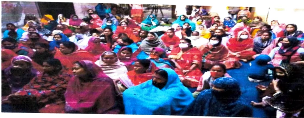
Around 80 women participated in the programme.

Financial Support and Scholarships: Information on scholarships and financial assistance for skill development, How to access funding opportunities.